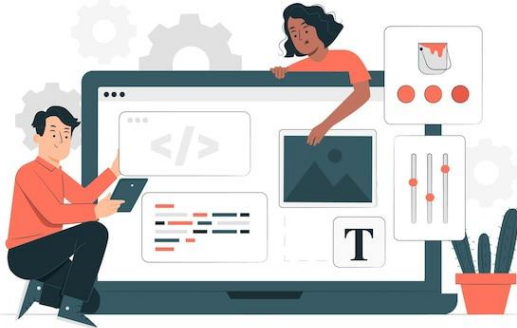
WEB & DIGITAL EXPERIENCE