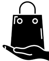
PRODUCT & PACKAGING