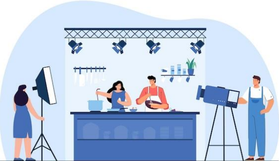
PRODUCTION & POST PRODUCTION